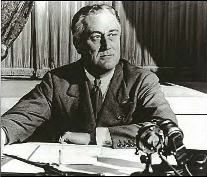
President Roosevelt approached Mussolini in December, 1938 to settle Jews in Abyssinia.