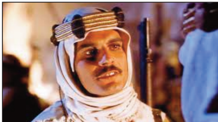
Arab Americans have the saga Lawrence of Arabia , we have The Godfather . Wanna switch?