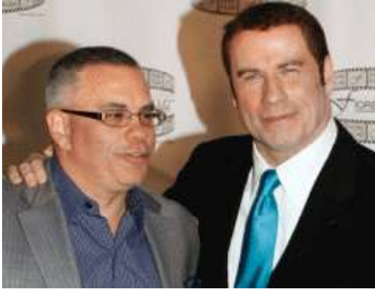
The “Mafia-Media Axis” in action as actor John Travolta (r) pals it up with John Gotti Jr.

and-post Goldwater) via significant direct mail contributions and generous subsidies from big-time donors. National Review magazine was founded in 1955—paving the way for Ronald Reagan and today’s Republicans—and kept solvent thanks to the financial backing of wealthy ideological bedfellows. Like Buckley’s benefactors, any one of the thousands of rich Italian Americans could save our heritage.