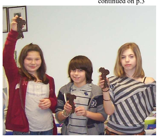
Our new "Hands-On" program introduces youngsters to crafts such as making a chocolate Italy and learning Italic calligraphy