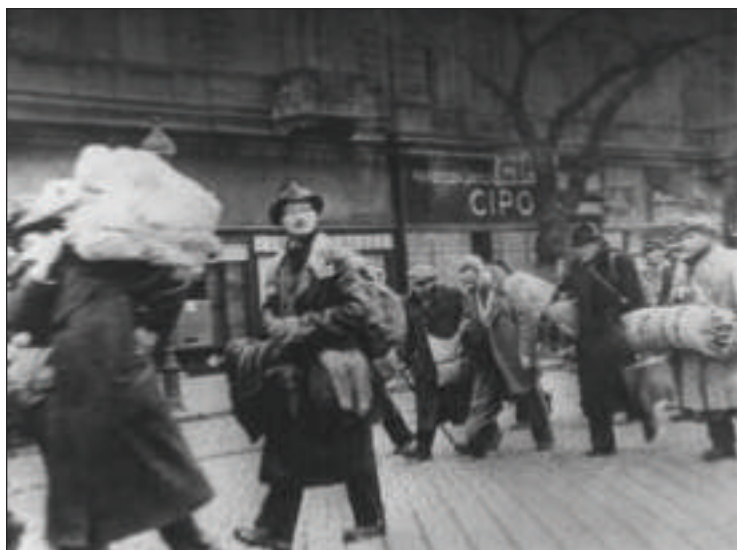
An image of the round-up of Jews in Hungary