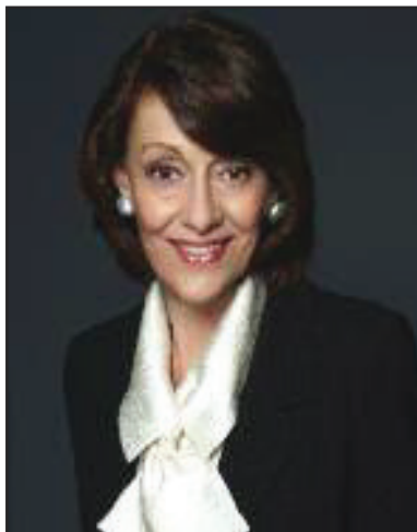
Evelyn Lauder Business Leader