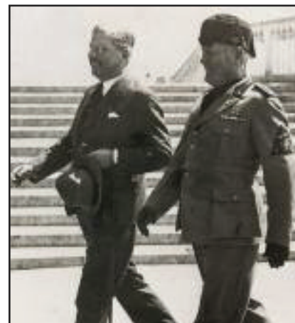
Austrian Premier Kurt Schuschnigg with Mussolini in Rome

From this bitter lesson, Hitler understood that his access to Austria would depend on neutralizing Fascist Italy. Austria was essentially an Italian protectorate.