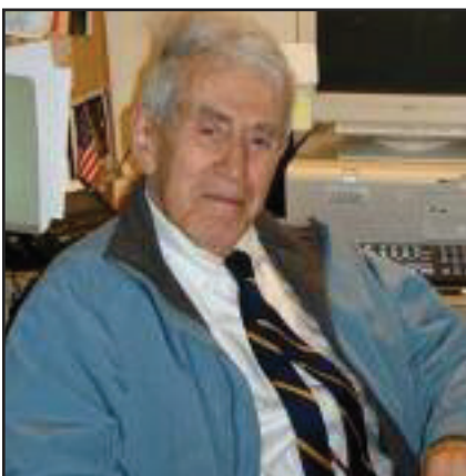
Klemens von Klemperer, of Jewish origin, fled Germany for Austria in 1935. There, he led an anti-Nazi student group until 1938.