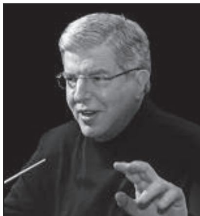
The father of composer Marvin Hamlisch (pictured) escaped to Italy in 1938